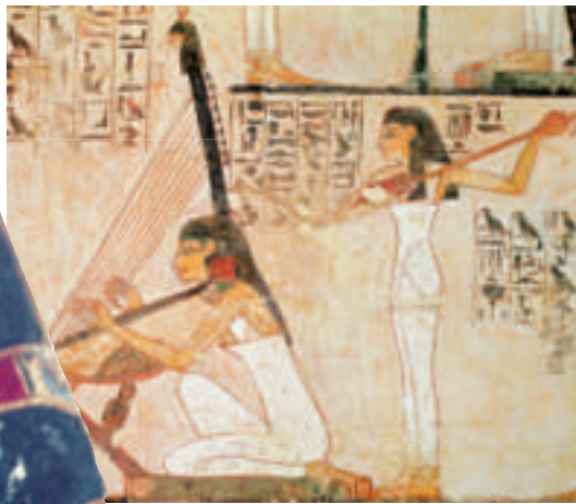
Egyptian women wore close-fitting dresses held up by shoulder straps.