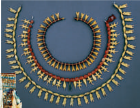
Three necklaces of gold and semiprecious stones crafted by artisans