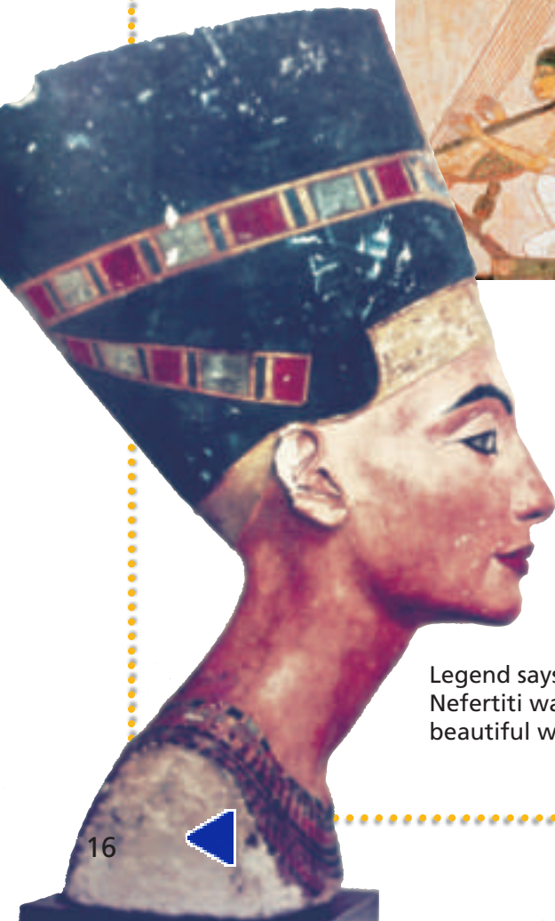
Legend says that Queen Nefertiti was the most beautiful woman in Egypt.