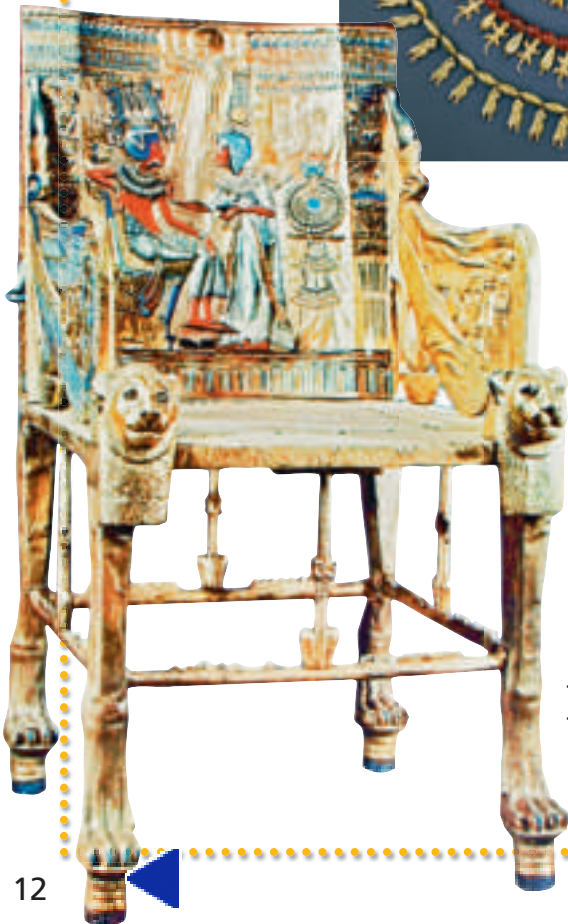
The throne of King Tutankhamen