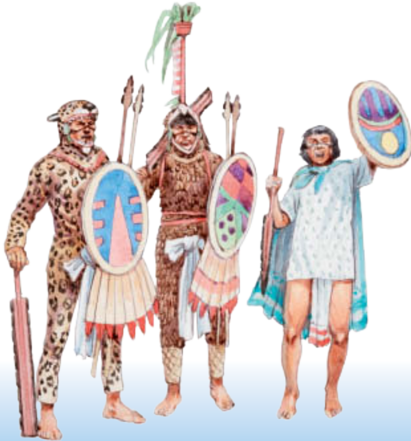
The Jaguar Warriors were among the best of the Aztec warriors.

Just like the Toltec, the bravest and most skilled Aztec warriors wore costumes to make them resemble animals. Among the best known were the Jaguar Warriors and the Eagle Warriors.