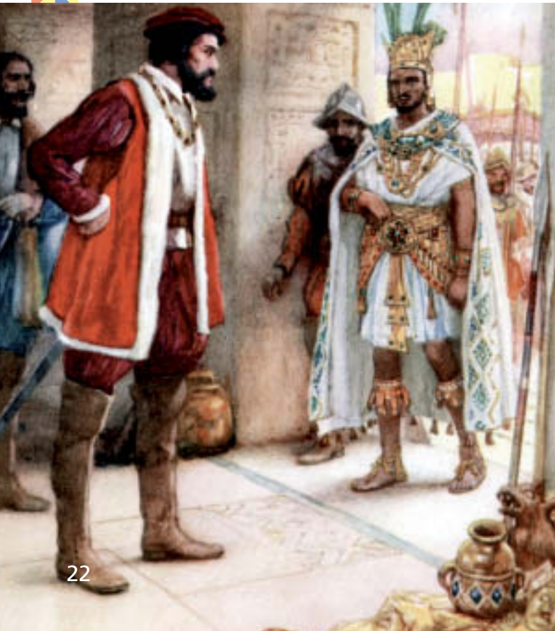
Montezuma welcomed Cortés.

Cortés returned in 1521 with his small group of Spanish soldiers and 15,000 native warriors. Despite the fact that the Aztecs feared the Spaniards' few horses, which they'd never seen before, Cortés and his allies would probably have had little chance against the fierce Aztec warriors if disease had not already spread through the city. With no immunity to European diseases, many Aztecs died from the diseases they caught from Spanish soldiers. Even so, it took three months of fighting street to street before Tenochtitlán fell. The Aztec Empire had ended, and the Spanish colonization of Mexico began.