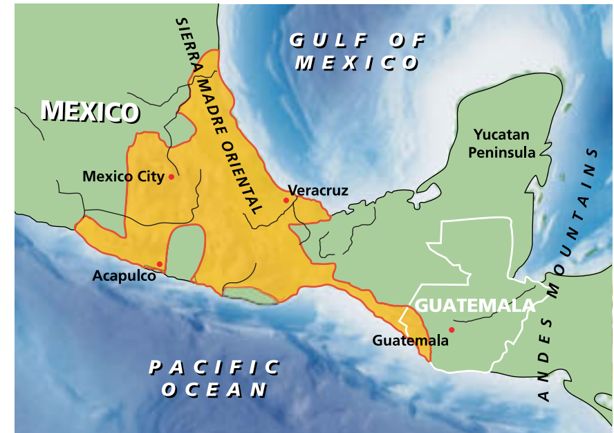
This map of the Aztec Empire at its height shows present-day city and country names. Mexico City was built on the site of Tenochtitlán.

In 1446 Tenochtitlán was severely flooded. The emperor ordered a large embankment to be built to prevent this disaster from happening again. Several years of bad harvests followed, and many people starved. The emperor decided to expand Aztec control to include areas outside the valley, where there were rich farmlands. In this way the ruler sought to enrich the kingdom and prevent another disaster.