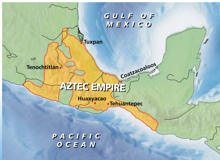
The region controlled by the triple alliance around 1440

There were two major reasons for the Aztecs' constant warfare against everyone around them. First and foremost, their religion required it. The Aztecs believed that their battles made their gods more powerful.