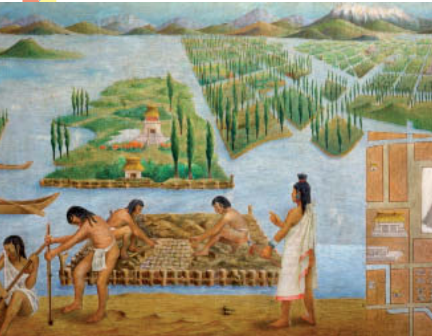
Aztecs building a chinampa

Chinampas were designed for farming. The Aztecs layered lake mud and vegetation, often reinforced with reeds and wooden posts, until the chinampas were a few feet above the surrounding water. This created fertile land where beans, maize, tomatoes, and chiles could be grown, to supply the needs of the city. Before long, the chinampas closest to the city were being used for expansion, rather than farming.