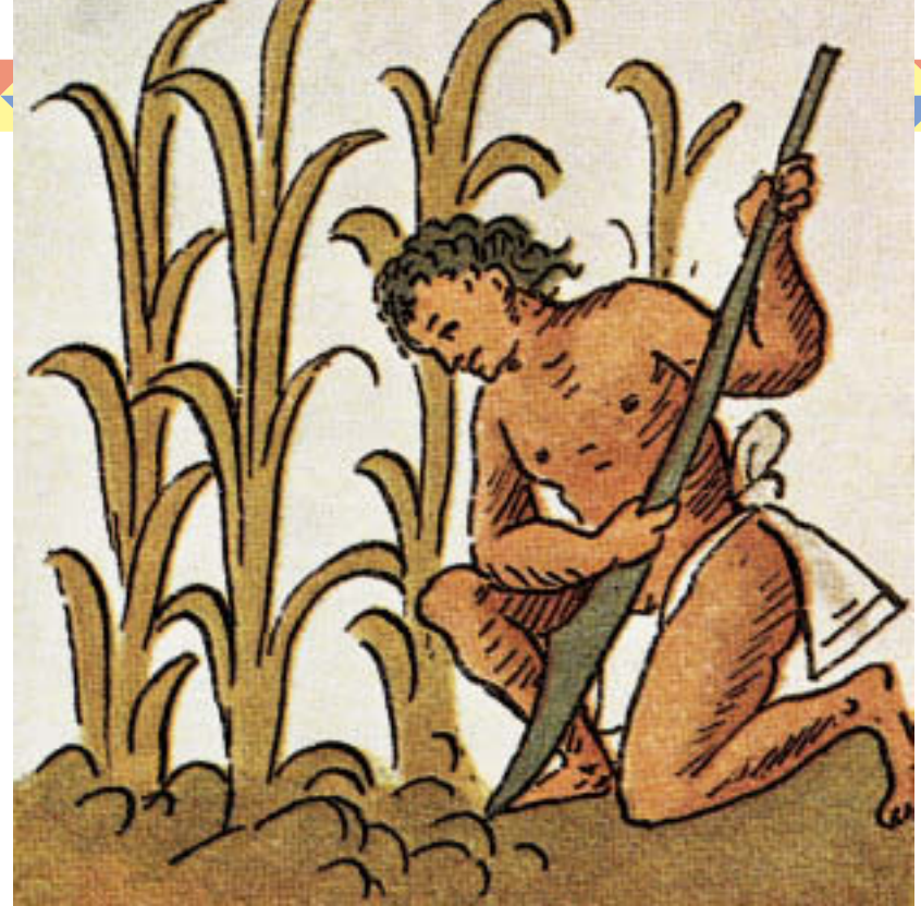
Commoners worked the land owned by their calpulli .

The biggest social group were the macehualtin or commoners. These were the merchants, farmers, and craftspeople. The farmers worked the land owned by their calpulli , or district. The merchants and craftspeople, who stayed in the city, enjoyed higher status than the farmers. The craftspeople who worked with gold or made weapons had higher status than those who made simple items such as baskets.