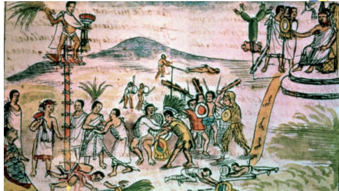
Conquered peoples had to pay tribute to the Aztecs.

By the 1440s the Aztecs controlled the entire Valley of Mexico. This was accomplished through both warfare and a kind of diplomacy. As the Aztecs had a reputation of being fierce in battle and ruthless with prisoners, they were able to convince some of the neighboring lords to surrender rather than fight. For a while, the Aztecs formed an alliance with two powerful neighboring states. The triple alliance began campaigns to conquer the regions surrounding the Valley of Mexico.