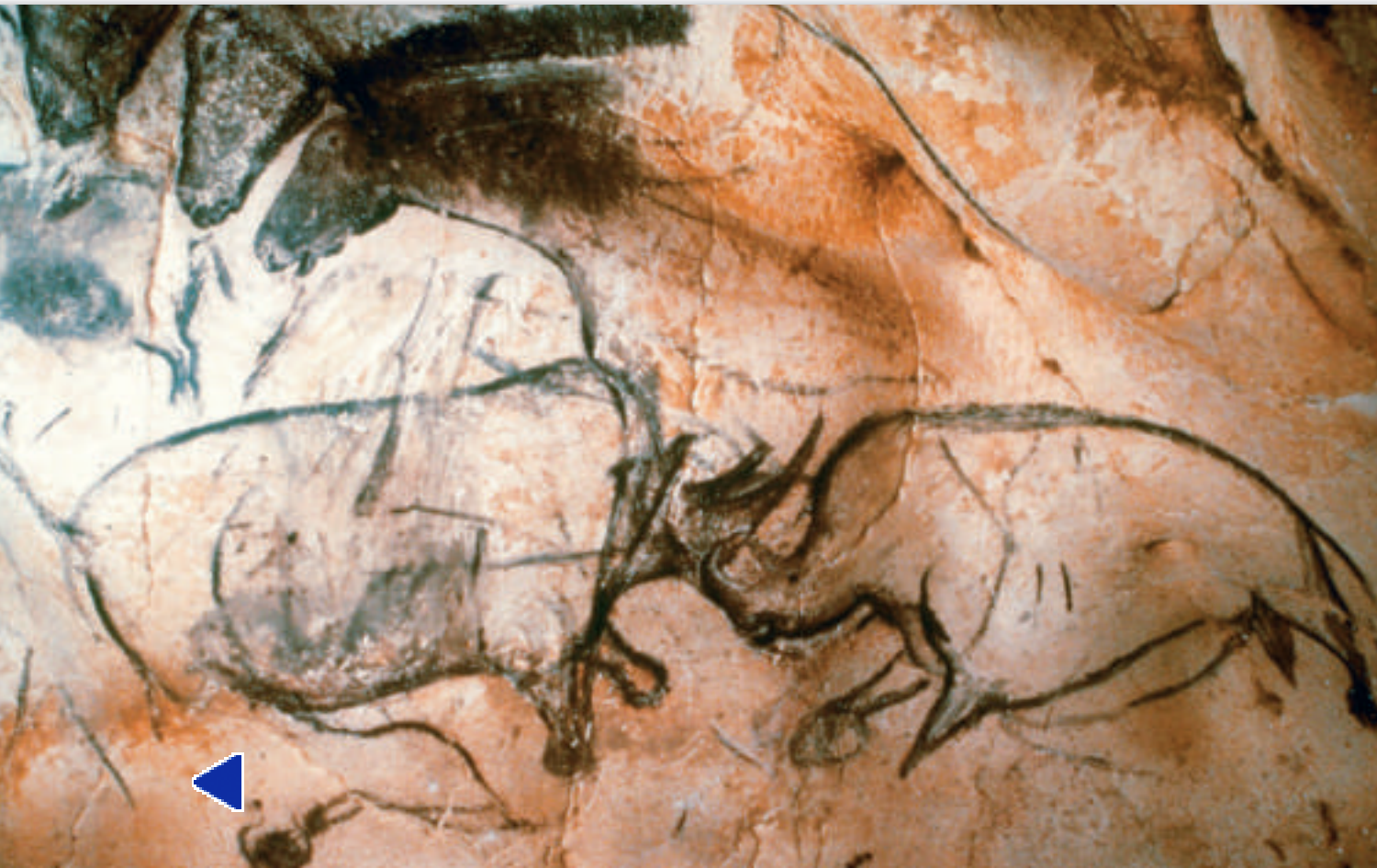
This cave painting in Chauvet, France, shows images of horses and rhinoceros.

Some scholars share the idea that the cave paintings are records to help people remember important ideas and events. When looked at from this point of view, cave paintings are like written records.